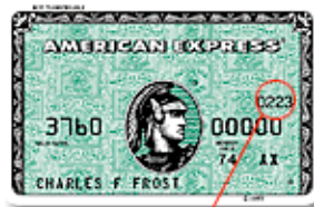
Card ID #

4 digit, non-embossed number printed above your account number on the face of your card.