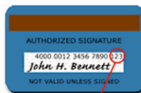
Card ID #