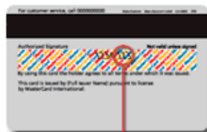
Card ID #

3-digit, non-embossed number printed on the signature panel on the back of the card immediately following the card account number.